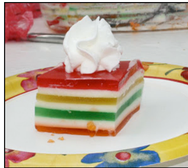
The first four Jell-O flavors were orange, lemon, strawberry, and raspberry. Lime was introduced in 1930.

There is no other dessert as wiggly and as jiggy as Jell-O. In fact, there is nothing quite like this gelatinous children's treat, so why shouldn't it have it's own weeklong celebration? February 12-18 is Jell-O Week.