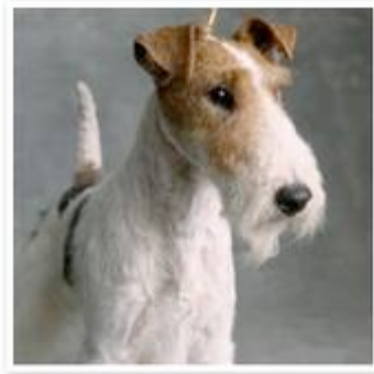
The wire fox terrier has won more of Westminster's Best In Show awards than any other breed.