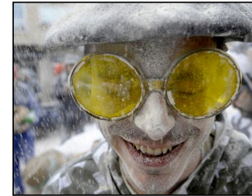
The entire town becomes engulfed in flour as people go after each other armed to the teeth with bags of the white stuff. The perfect blow is a handful delivered to the face, smothering the cheeks, mouth, and nose.

The February days leading up to the start of Lent can get pretty crazy. New Orleans has Mardi Gras, and the Caribbean Islands celebrate Carnivale. But the town of Viana do Bolo, in the Galicia region of northwest Spain, has a tradition that takes the cake — or rather, that takes the cake flour. This is the Flour Battle, where locals, armed with bags of the powder, douse each other until the entire town is covered in a blanket of white.